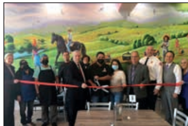
Carnitas Quiroga 6403 West 79th Street Ribbon Cutting ~ October 27, 2021