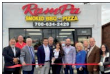
RamPa Smoked BBQ-Pizza 5612 West 87th Street Ribbon Cutting ~ October 15, 2021

I am pleased to announce and welcome to the City of Burbank, the following new businesses: