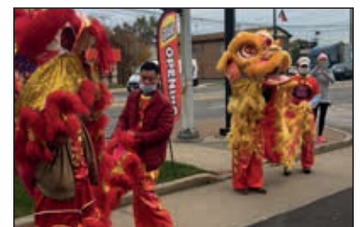
New Ing's Palace 6955 West 79th Street Ribbon Cutting ~ November 4, 2021