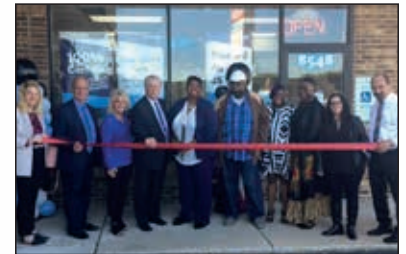
Jackson Hewitt 8548 South Cicero Avenue Ribbon Cutting ~ October 20, 2021